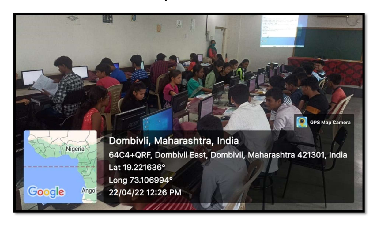
Computer Lab – 1