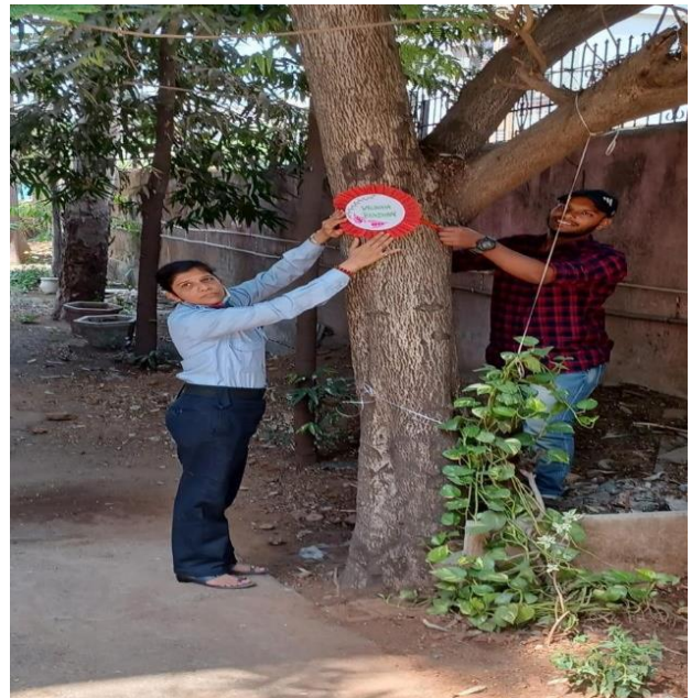
INVOLVEMENT OF SUTDENTS AND EVEN SECURITY STAFF IN “VRUAKSHBANDHAN PROGRAM”