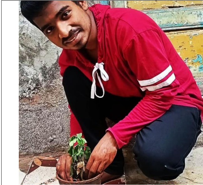
STUDENT PLANTING MEDICINAL PLANT