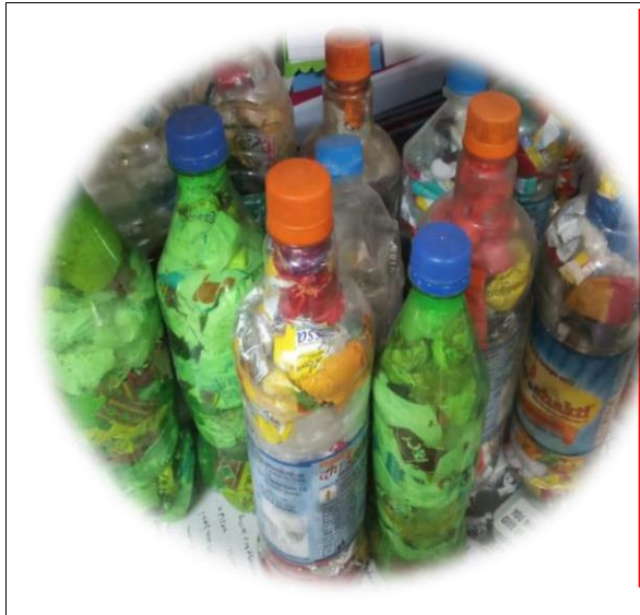
CREATION OF PLASTIC BOTTLE BRICKS