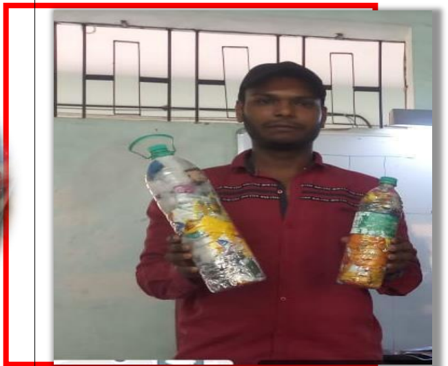
STUDENT DEMONSTRATING HOW TO CREATE BRICK BOTTLES.